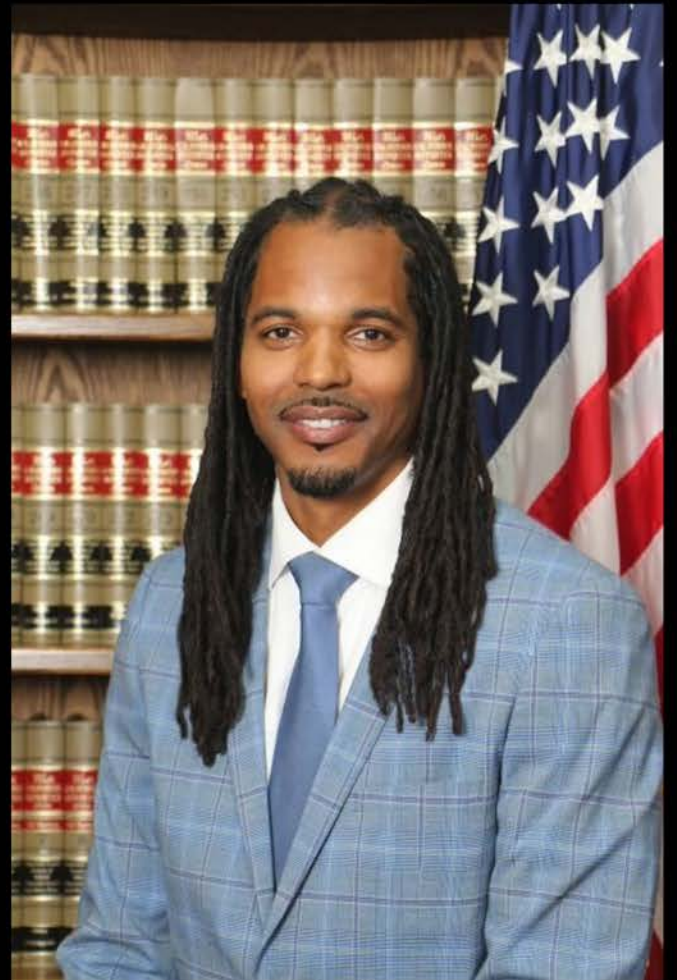
Councilman Andre Spicer City of Compton, District 2